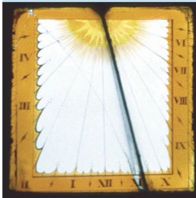
Figure 2. The Kersal Cell stained-glass sundial.

Thus Kersal Cell was initially a well-founded establishment, but one which struggled to survive in the 14th century and which was finally surrendered to the Crown in 1539, following the Act for the Suppression of the Lesser Monasteries of 1536. It was this Act, in the 27th year of the reign of King Henry